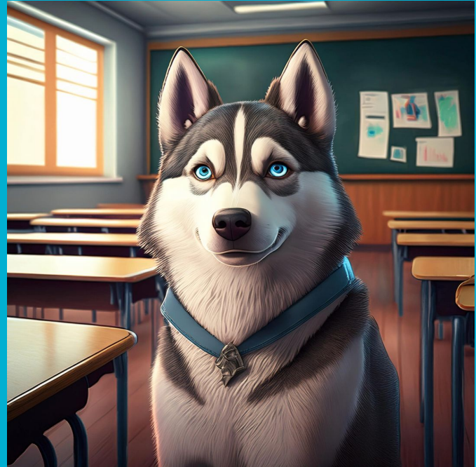
AI Image generated using Adobe Express